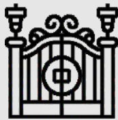
Gated & Secured Community