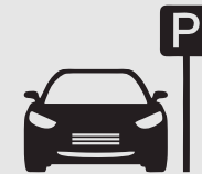
Ample Car Park